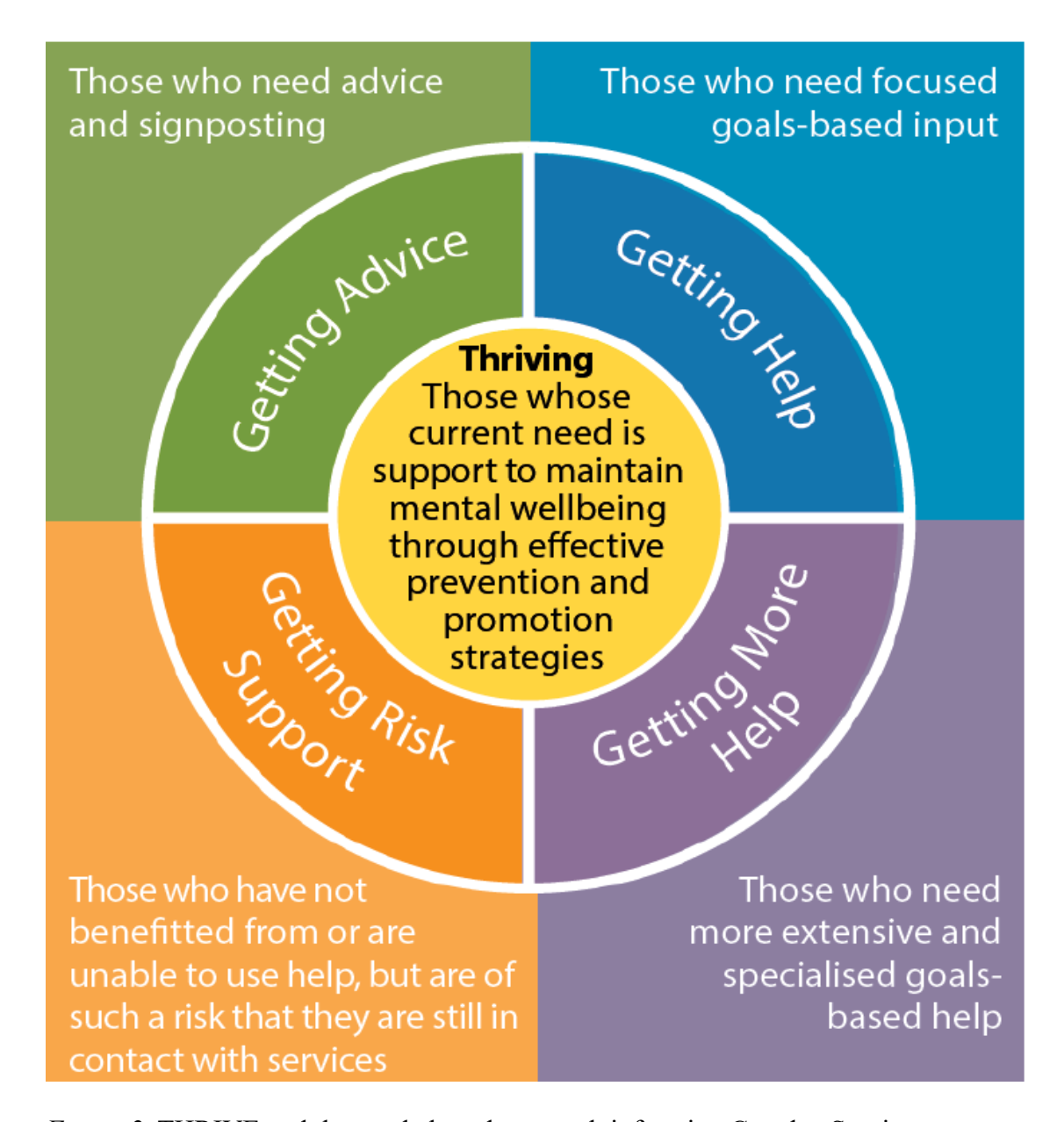
Figure 2. THRIVE and the needs-based approach informing Camden Services